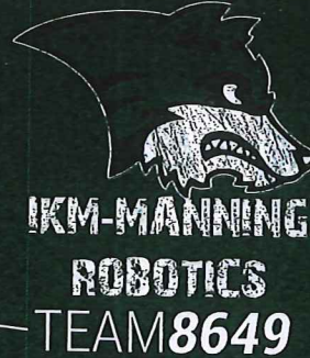
LEFT CHEST DETAIL